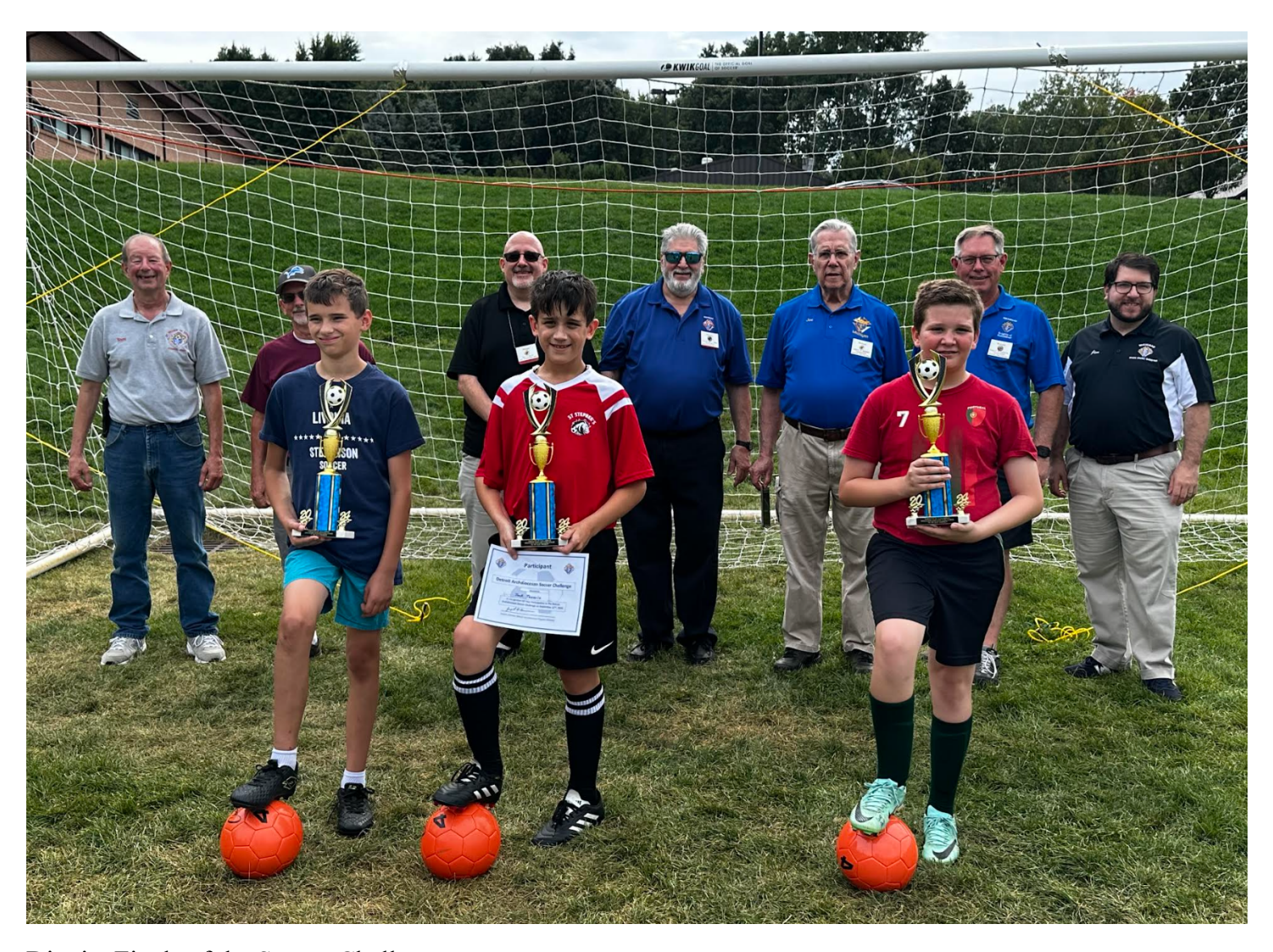
District Finals of the Soccer Challenge