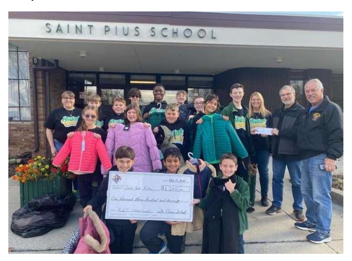
Presentation of the check from the students to the O'Brien Council